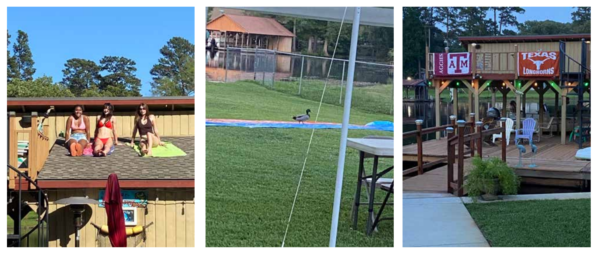
My granddaughter and her friends love to sun bath on our boathouse roof while enjoying the water views.

We had a graduation party for our grandson and his girlfriend one going to A&M one to UT Austin. We had lots of activities setup, one was a slip and slide. This duck decided to try it out. I believe he enjoyed it several more flew in to check it out.