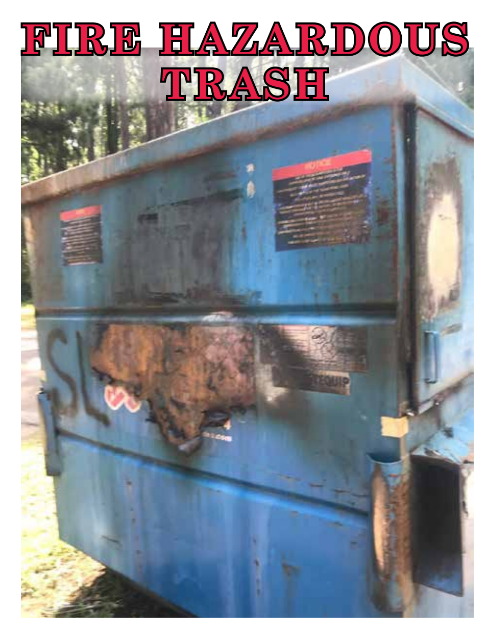
Please be mindful when throwing away household trash. These dumpsters are not meant for anything that has been burned. These types of issues can cause fires that can get out of control and can also set the trash truck on fire. We are responsible for paying for replacing these dumpsters when it is not damaged from normal wear and tear.