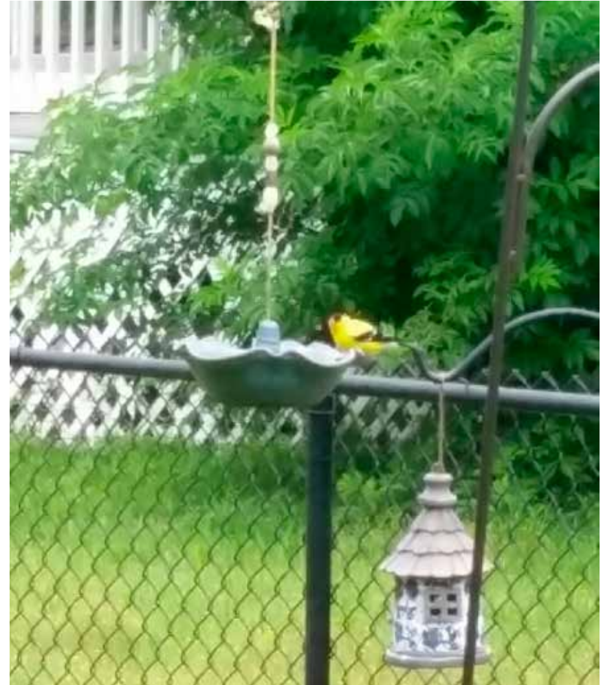
Yellow Finch