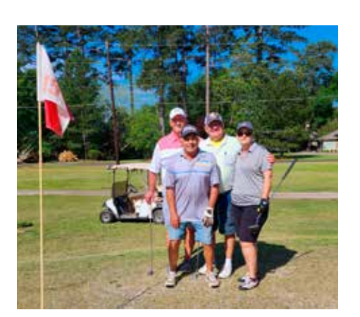
1st Place team

See you on the course! Hit them long & straight.