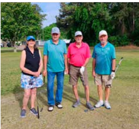
2nd place team