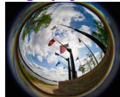
Looking Around - Holly Treadway

December will be our holiday gathering. Time and place to be determined. Plan your white elephant gift exchange items! It was great fun last year.