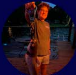
Dawson, 14 Bream & Catfish